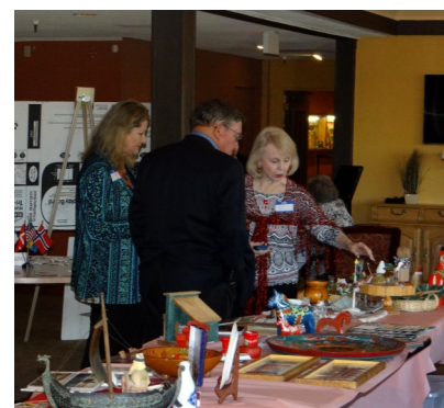
We enjoyed the many Scandinavian artifacts