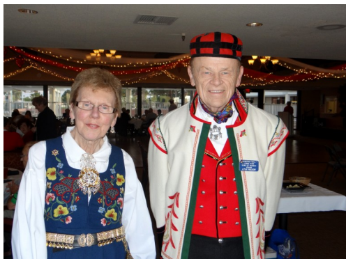
The Nelsons in Scandinavian dress